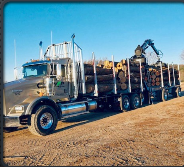
Wisconsin Log Truck