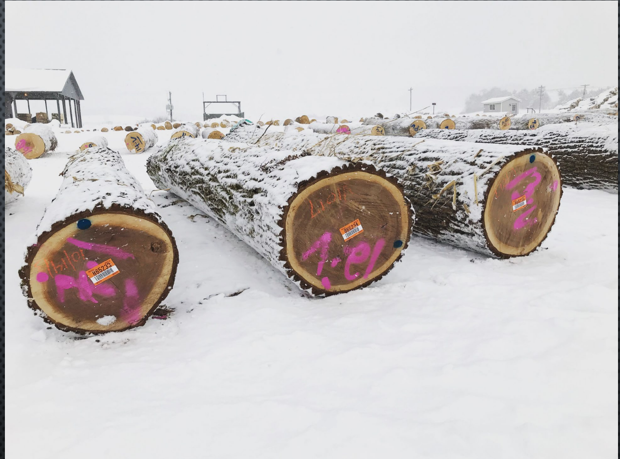
High Quality Walnut Veneer Logs Getting Prepped for Sale