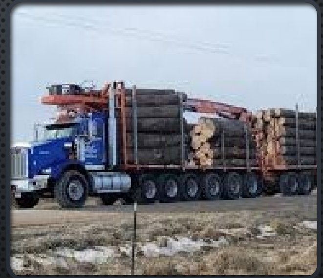
Michigan Log Truck