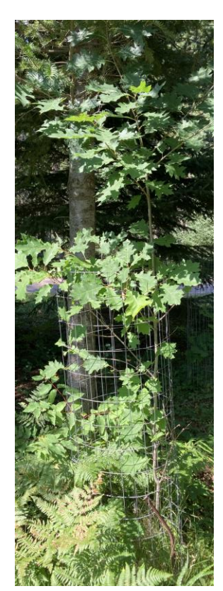
Natural Resources Conservation Service

American Bird Conservancy, Lumberjack Resource Conservation & Development Council, Marinette County Land Information Dept, My WI Woods, Northwoods Land Trust, Ruffed Grouse & American Woodcock Society, Trout Unlimited, WI DNR, WI Woodland Owners Association, WI Young Forest Partnership